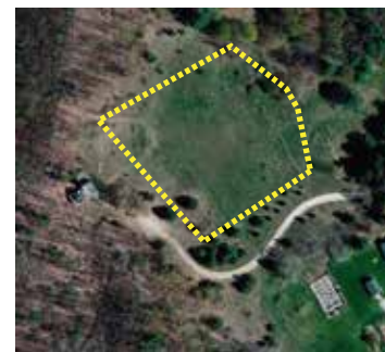
Cedar Lake Vineyard