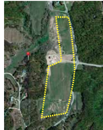
Crain Hill Vineyard